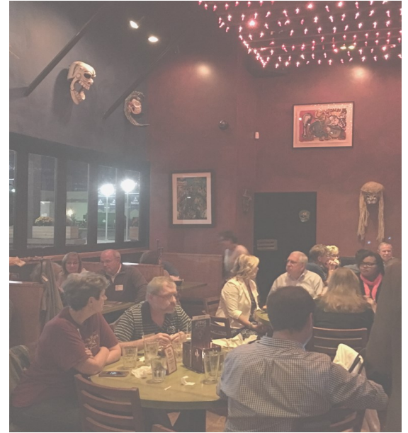
Some of our guests at Mad Mex