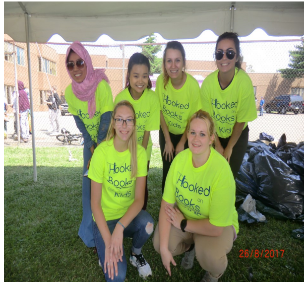
Five of the Gannon Students who helped at Haircut Day.

We distribute books at these events to encourage students and parents to begin the school year with books that will encourage reading and promote success in school and life.